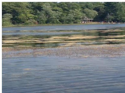
Sparrow Lake August 2012

Do SLA members want to participate in an Environmental Watch - Weed and Water? Members could monitor our shorelines to record occurrences and report changes. We do hope that Mother Nature has run her course and that there is no or very little invasive weed this coming summer. Last summer's extreme heat and dryness were unusual.