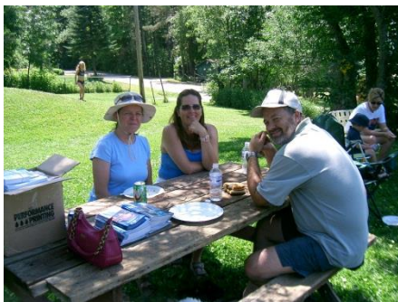
Family Day Picnic

Price includes fishing derby, games, prizes and lunch. Fishing from 9:30–11:30 a.m. Lunch and games at 12:00 p.m.