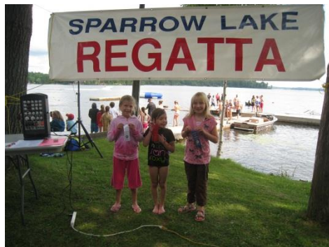
Sparrow Lake Annual Regatta at Bayview Wildwood Resort

Why; Fun for the whole family, friendly competition, social enjoyment, good food